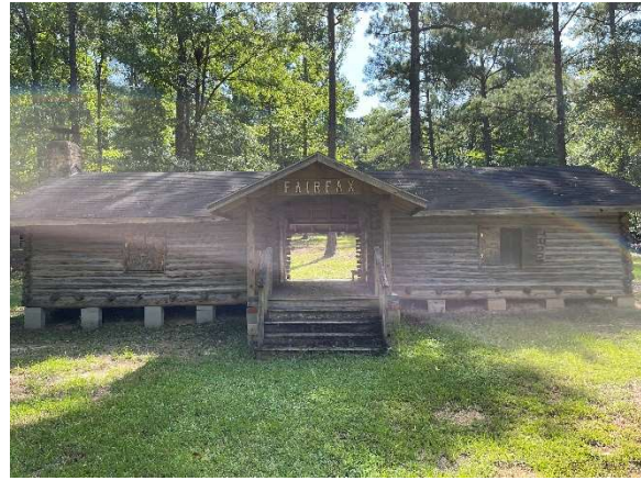
Above: (L) West Point Cabin (20 beds may be available) (R) Fairfax Cabin (20 beds)

***West Point may be available. Please register and select it as one of your choices, and we will notify your unit by mid-September.