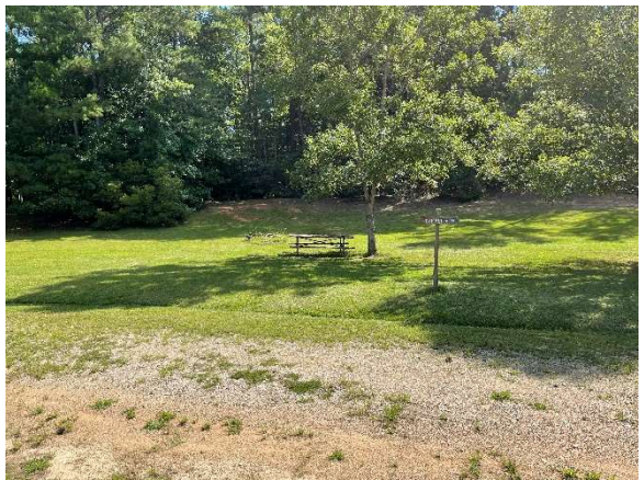
Above: (L) Campsite 3; (R) Campsite 4