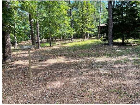
Above: (L) Campsite 7 and Activity Field; (R) Campsite 8