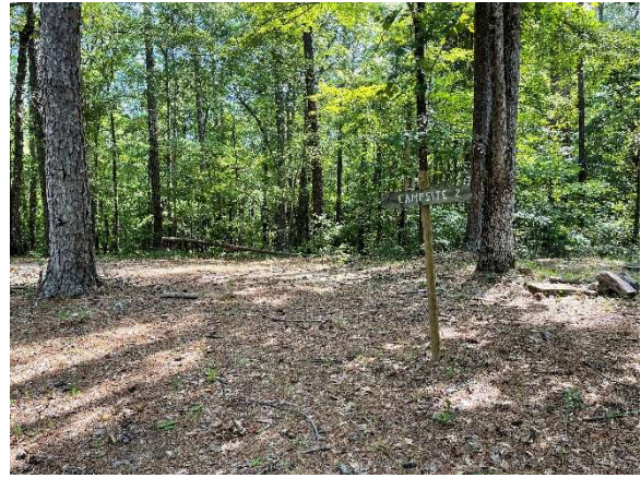
Above: (L) Campsite 1; (R) Campsite 2