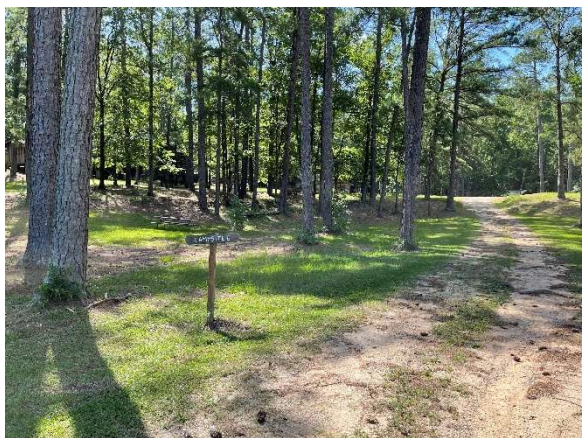
Above: (L) Campsite 5 and Riverview Chimney; (R) Campsite 6