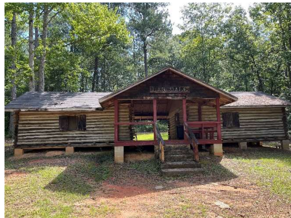
Above: (L) Campsite 12 (no vehicles or trailers permitted) (R) Langdale Cabin (20 mattresses)