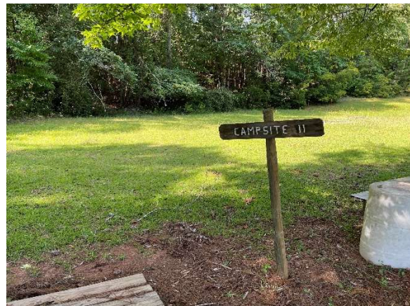
Above: (L) Campsite 10; (R) Campsite 11 (no vehicles or trailers permitted)